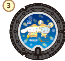
Oimachi Beachuu 大井町ビーチユウ

1-50 Oi, Shinagawa City (3-minute walk from Oimachi Sta.) 大井1-50 (大井町駅 徒歩3分)