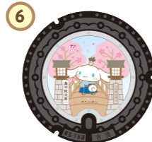
Shinagawa Bridge Cherry Blossoms 品川橋さくら

1-5 Osaki, Shinagawa City (5-minute walk from Osaki Sta.) 大崎1-5 (大崎駅 徒歩5分)