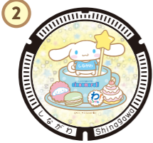
Oimachi Illumination 大井町イルミネーション

1-3 Oi, Shinagawa City (1-minute walk from Oimachi Sta.) 大井1-3 (大井町駅 徒歩1分)