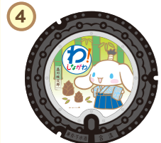
Musashi-koyama Bamboo Shoots 武蔵小山たけのこ

1-23 Oi, Shinagawa City (3-minute walk from Oimachi Sta.) 大井1-23 (大井町駅 徒歩3分)