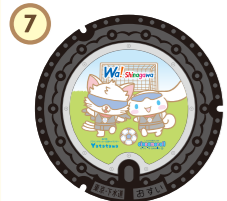
Tennozu Yatatama 天王洲やたたま

1-3 Minami Shinagawa, Shinagawa City (5-minute walk from Shimbamba Sta.) 南品川1-3 (新馬場駅 徒歩5分)