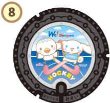
Oifutou Shinakamon 大井ふ頭シナカモン

2-5 Higashi Shinagawa, Shinagawa City (1-minute walk from Tennozu Isle Sta.) 東品川2-5 (天王洲アイランド駅 徒歩1分)