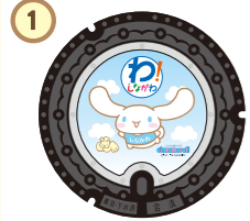
Oimachi Sky 大井町あおぞら

Cinnamoroll, Shinagawa city tourism ambassador, appears on manhole covers! The illustrations represent various places of interest in Shinagawa city.