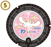
Osaki Cherry Blossoms 大崎さくら

3-27 Koyama, Shinagawa City (1-minute walk from west exit of Musashi-koyama Sta. in front of bus rotary.) 小山3-27 (武蔵小山駅 徒歩1分)